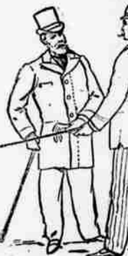
Prices vary, to say nothing of men's full suits from $3.00 to $5.00. Here they go—tickets and figures for every stock of garments, with the cheapest price.