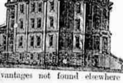
advantages not found elsewhere in this state.

Expenses light: a boarding hall in the College building on the club plan, President Brownson steward, thus guaranteeing good board at the least possible cost to the student. Board can also be had in private families at $2.50 to $3.00 per week, including lodging.