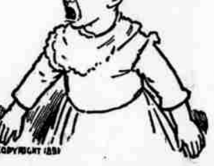
Full of trouble

New ork sole, hand turned shoes, something entirely new, not a winter shoe but light and flexible for spring and summer wear, at L. & D. Peacock & Co's, Call and inspect them.