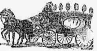
Extra Charge for Hearse or Services

EMBALMING and the proper care of the dead a specialty.