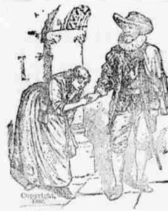
"THE KING'S TOUCH"

I. O. O. F.—Albany Lodge No 4 holds its regular meeting Wednesday evening of each week. Visiting brothers are cordially invited to attend.