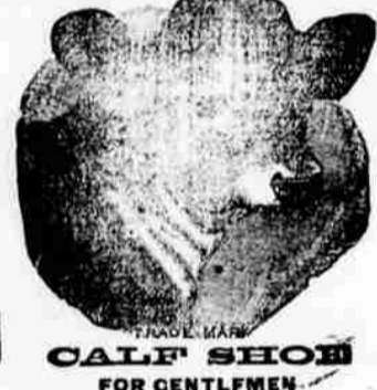
TRADE MARK CALF SHOE FOR GENTLEMEN

Is the Best Shoe in the Market for the Price.