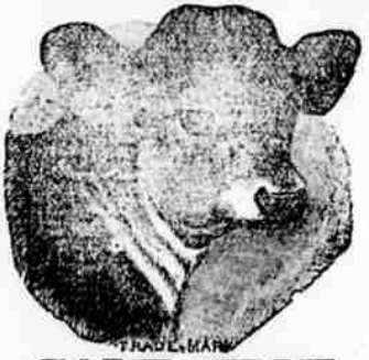
CALF SHOE FOR GENTLEMEN

Is the Best Shoe in the Market for the Price.