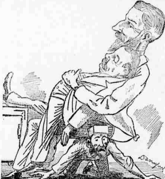
Jim and the Oppressed Laborer—"This is comfort. This is real enjoyment!" "There is no pleasure in this for me! How long must I bear this burden?"

All kinds of poultry, alive or dressed wanted at the Willamette Picking Company's Store, Albany, Oregon.