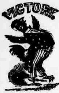
THE GREAT VICTORY.

Later election returns show that the tide was all in favor of the democrats. The net result is about as follows: In New York the democrats elect their state ticket by about 22000 majority and gain ten members in the legislature. In the city Tammany Hall gains a sweeping victory over the combination put up between the County Democracy and the republicans. Democrats carry New Jersey by 10000 majority and have both branches of the legislature. Virginia was carried over Mahone by 35,000 majority and the democrats have two thirds majorities in both branches of the legislature. Democrats carry Ohio by 12,000 majority and have a majority on joint ballot in the legislature. Democrats carry Iowa by about 5,000. Republicans have a small majority in the legislature. Republicans carry Massachusetts by about 6,000 majority on their state ticket and the legislature by a greatly reduced majority. Pennsylvania and Nebraska are republican. The victory is a great one for the democrats and republicans are greatly cast down.