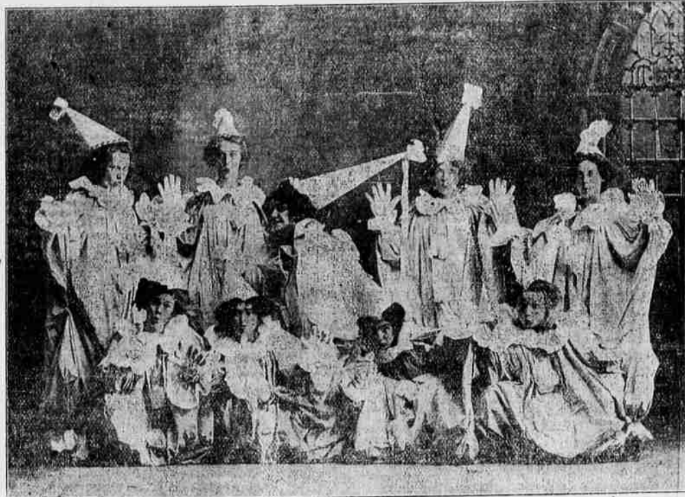
Some of the Topsy Turvy crowd of performers, of Salem, to be at the Opera House Monday night, August 22, under the auspices of the Albany Blues.