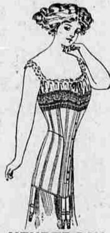
HENDERSON Fashion Form Corsets

The Hendersen corsets range in price from $1.25 to $5.00. Let us fit you.