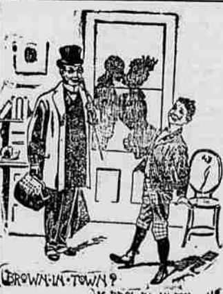
"BROWN'S IN TOWN"