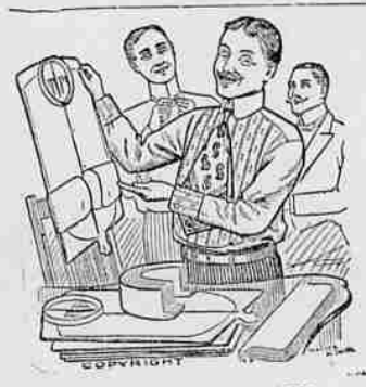
SHIRTS THAT FALK!

Jackets, Suits, Capes, Flannel Waists, Underwear, Art Goods, Shoes,