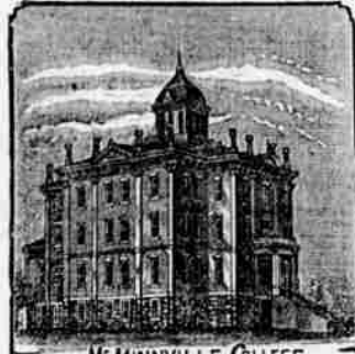
McMINNVILLE COLLEGE McMinnville, Or.

Summer and fall suits and pants in any style a specialty. Cleaning and repairing promptly attended to, Main street, Albany, Oregon.