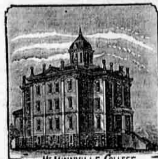
McMINNVILLE COLLEGE McMinnville, Or.

Two courses of study of four years each, two of three years, and two of two years. Good rooms in College building on first floor, adjoining President's rooms, reserved for young women. Rooms on second and third floor for young men. Boarding department in basement. Correspondence invited. For catalogue address