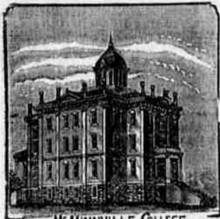
McMINVILLE COLLEGE McMinville, Or.

Wheat—64c. Oats—33c Butter—20 cts per lb. Eggs—18c Hay—0.00 Potatoes—20 cts per bushel. Beef—on foot, 3 1/2 Apples—1.00 cts per box. Pork—6c per lb. dressed. Bacon—ham, 12 1/2c. shoulders, 7c. sides, 10c. Lard—12c per lb. Flour—4.20 per 100. Chickens—2.50 per doz. Milk Feed—bran, 11.00 per ton sow, 16 milkings, 26. Chor 30.