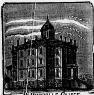
McMINNVILLE COLLEGE McMinnville, Or.

Wheat—62c. Oats—33c Butter—20 cts per lb. Eggs—18c Hay—9.00 Potatoes—$3.00 per bushel. Beef—on foot, 3 1/2¢ Apples—1.00 each per bu. Pork—on foot, 17¢ Bacon—on foot, 12 1/2¢ Lard—12¢ per lb. Flour—1.80 per bbl. Chickens—2.50 per doz. Milk Feed—bran, 14.00 per ton shores, 16. millings, 20. Choc. 20.