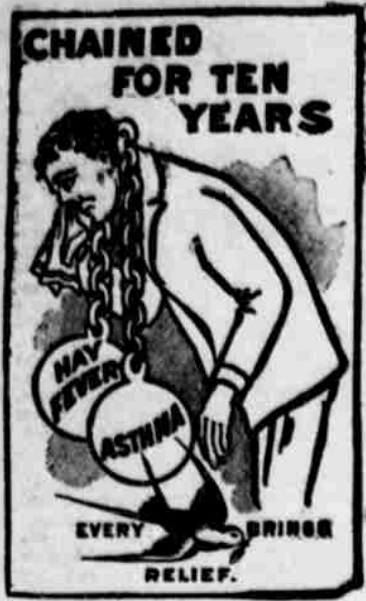
CHAINED FOR TEN YEARS EVERY DAY BRINGS RELIEF.

SENT ABSOLUTELY FREE ON RECEIPT OF POSTAL. Write your name and address plainly.