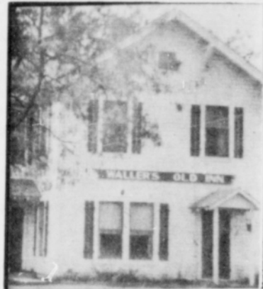
Rooms and Apartments WALLERS INN