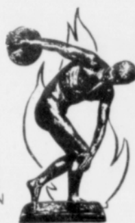
2. HAVE ANCIENT GREEK OLYMPIC RECORDS BEEN BESTED?