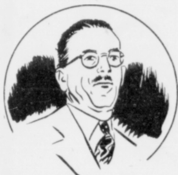
1. WHICH FAMOUS STATESMAN WAS A CONCENTRATION CAMP INMATE?