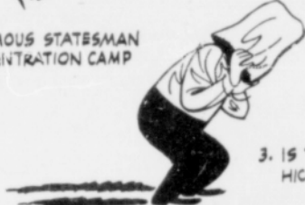
3. IS THERE A CURE FOR HICCUPS?

(1) Dr. Leopold Figl, chancellor of Austria and recent visitor to the United States, spent five years in the notorious Dachau concentration camp. He was arrested in 1938 when the Nazis took over Austria. Guards whipped him with steel-threaded oxhide lashes. Once he was forced to stand 54 hours at attention in the open air with 3,000 other prisoners, until the last of six escaped prisoners had been recaptured.