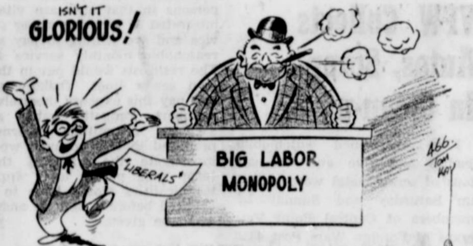
Strange How The "Liberal" Mind Works