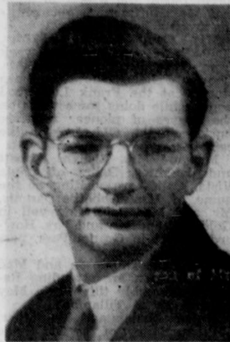
Civil Air Patrol since January, 1953.