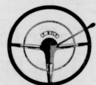
NEW "BLUE-FLAME 136" WITH POWERGLIDE