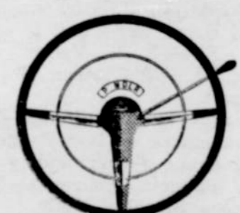
NEW "TURBO-FIRE V8" WITH POWERGLIDE