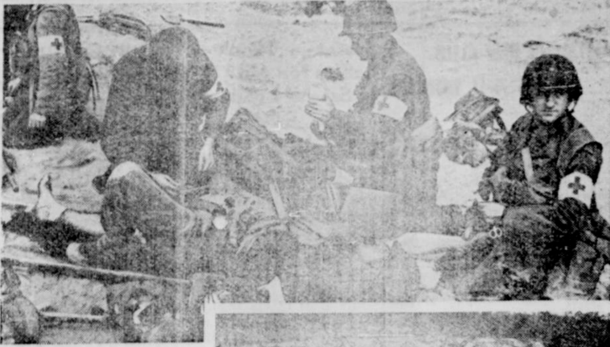
Carrying their own weapons of mercy, men of the Army Medical Department (above) give first aid under fire, get the wounded back to evacuation hospitals (right).