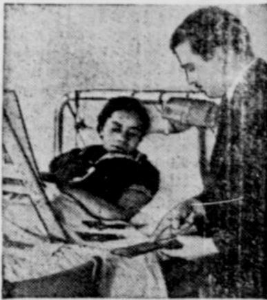
Negro girl, recovering from tuberculosis, receiving instruction in art. Tuberculosis associations are conducting campaign this month to find persons with early tuberculosis.