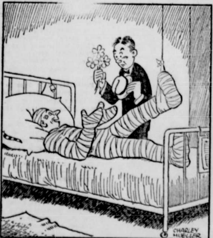
"We were on a three-lane highway in heavy traffic, and the cops thought I'd let him pass ME!"