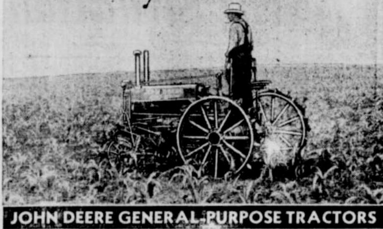
JOHN DEERE GENERAL PURPOSE TRACTORS

You'll like this feature. It relieves fatigue, puts you above the dust in extreme conditions, gives a better view in cultivating crooked rows. You'll also like the economy, dependability, simplicity, adaptability of John Deere General Purpose Tractors. You'll like the money you save by burning the low-cost fuels. You'll like the many other exclusive features that make these the outstanding General Purpose Tractors.