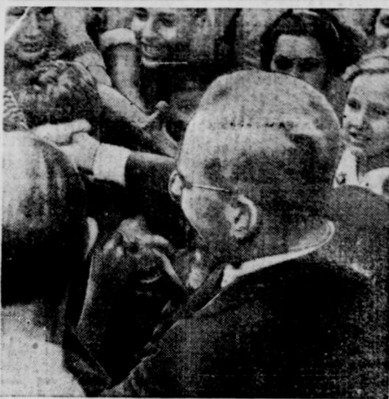
During a brief stopover in Chicago, Gov. Alf M. Landon, Republican candidate for President, was stormed by young boys and girls eager to shake his hand. Here he is besieged after leaving his train. During this campaign swing Gov. Landon said "A child reared in a hamlet or on a distant farm deserves the same opportunities to receive an education and to develop as are given the boy or girl who attends the most richly endowed school."