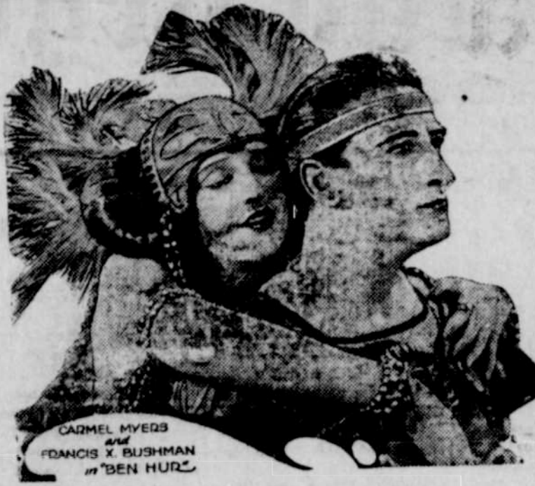
Coming Monday for 3 days at the Vining Theatre

A quick and sure relief in the most severe cases it drives out the uric acid poison of Rheumatism, Neuritis, Lumbago reduces pain and swelling sold on guarantee by McNair Brothers Druggists, Ashland and Jarmin Woods Drug Store, Medford, Oregon. 74-86