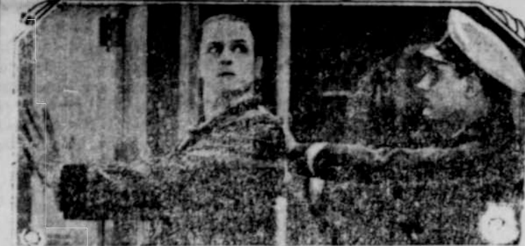
Scene from "OUT ALL NIGHT" starring REGINALD DENNY with MARION NIXON A Universal Super Comedy at the Vining Theater Sunday only.