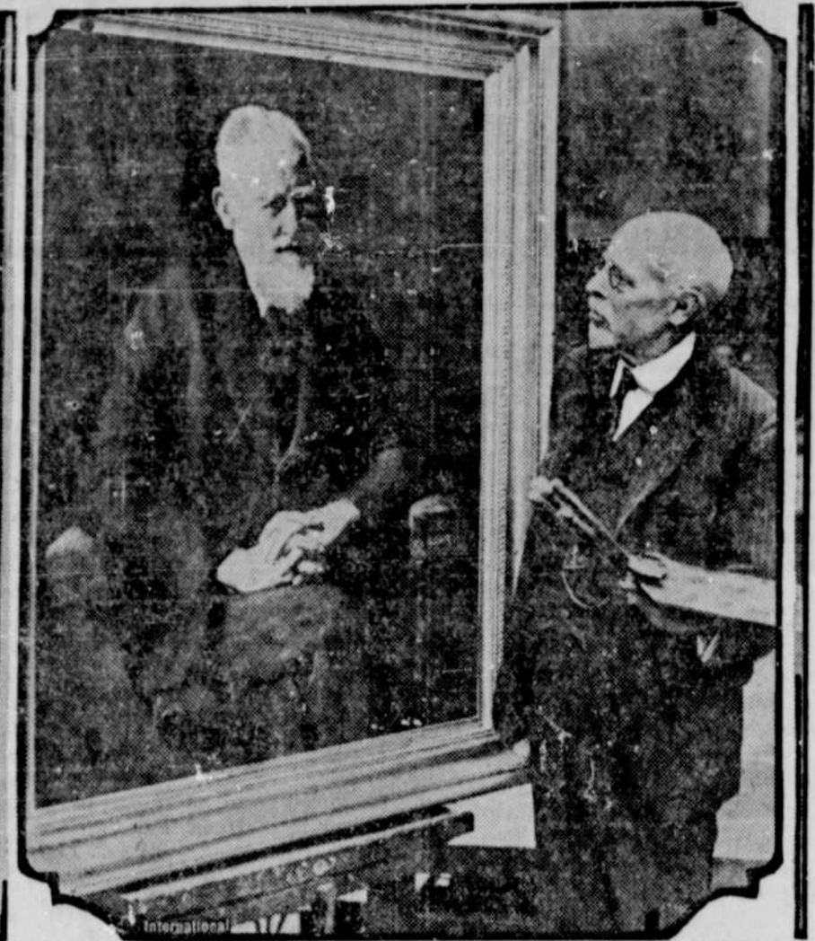
John Collier, famed artist, with his painting of George Bernard Shaw, British writer and critic, who has been turned down by the hanging committee for this year's Royal academy exhibit in London.