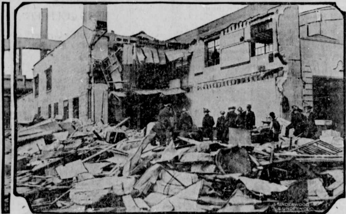
General view of the wreckage, caused by a mysterious explosion that demolished the executive offices of the Yellow Taxi Cab company in New York city. Seven persons were killed and forty-one injured.