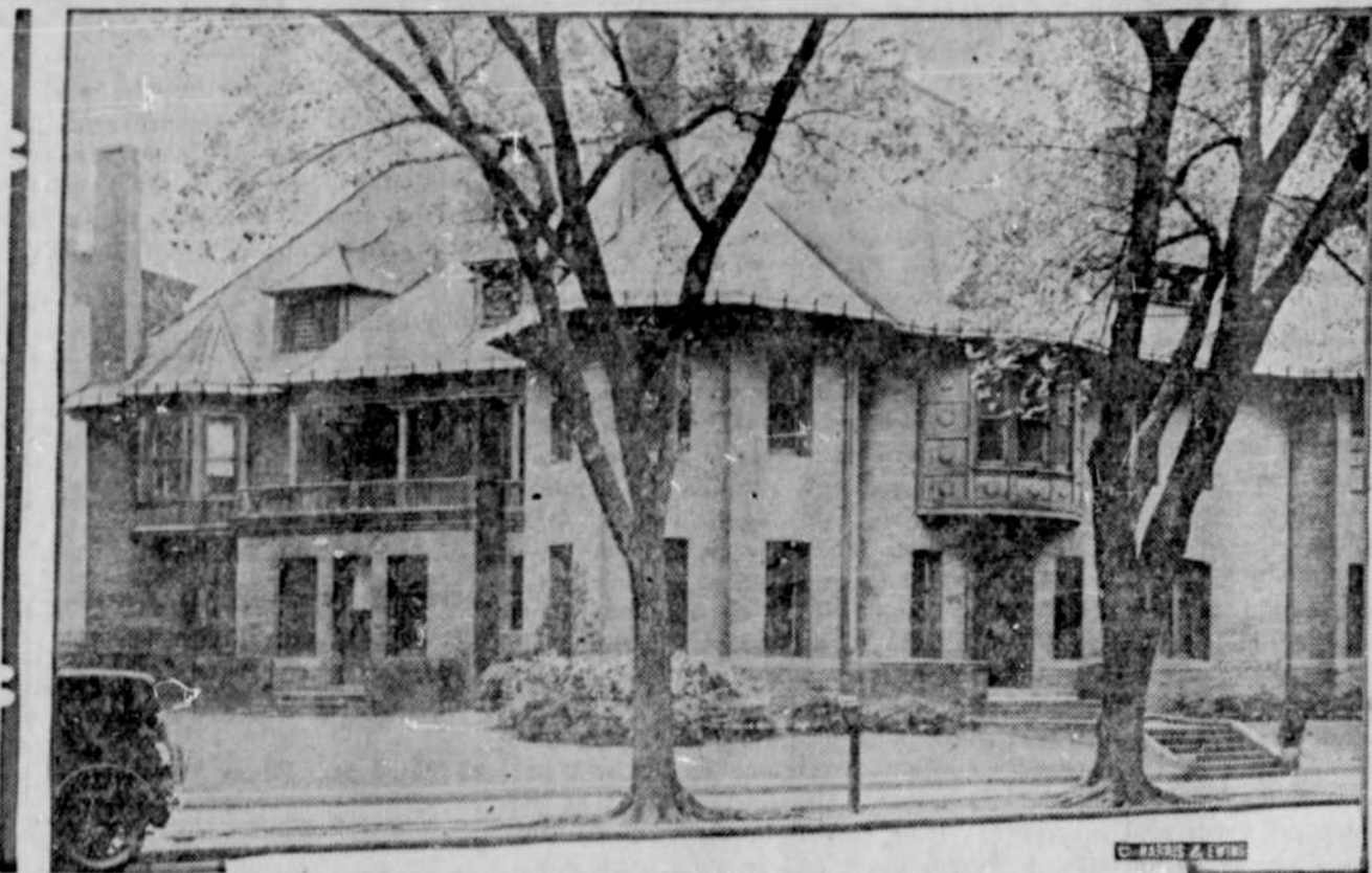
This handsome old mansion on fashionable New Hampshire avenue in Washington has been purchased by the Women's National Democratic club for its headquarters in the national capital. The club has made rapid progress in the last few years.