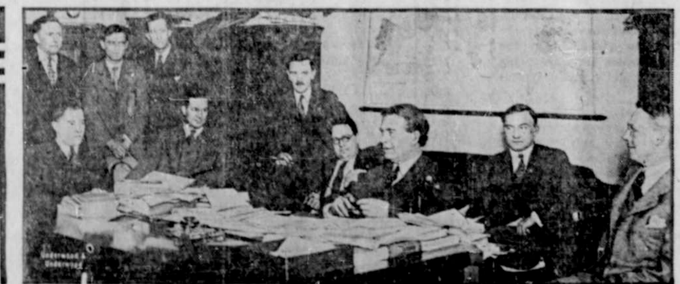
Every afternoon at three o'clock press correspondents in Washington gather in the office of Senator William E. Borah of Idaho and listen to what the chairman of the senate foreign relations committee has to give out. Senator Borah is the only one in the national capital, except the President and some cabinet officers to hold such conferences with the press. The photograph shows one of the conferences.