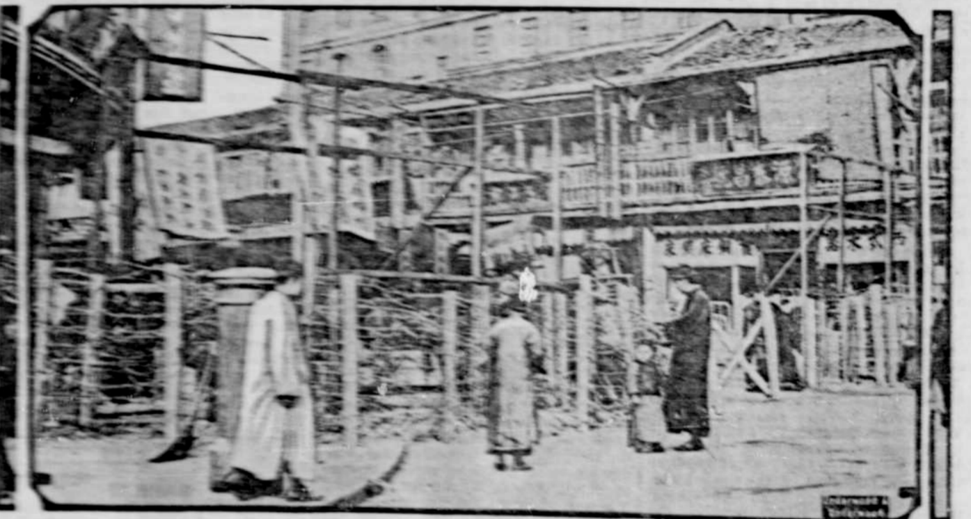
Chinese Nationalists recently captured Shanghai, driving out the northerners. The photograph shows the wire entanglements thrown up to protect the foreign section.