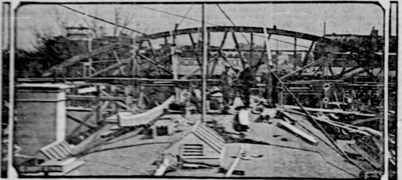
A complete new roof will be on the White House by the time President Coolidge moves in again next September. This photograph shows the preparations workmen have made for a temporary roof while the old one is being removed.