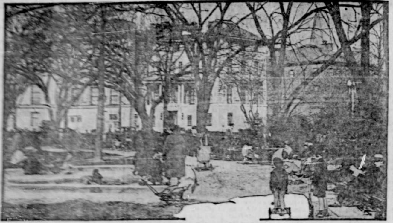
Children have made a playground of Dupont circle, the "front yard" of the temporary White House. The photograph shows a typical afternoon scene in the park-circle.