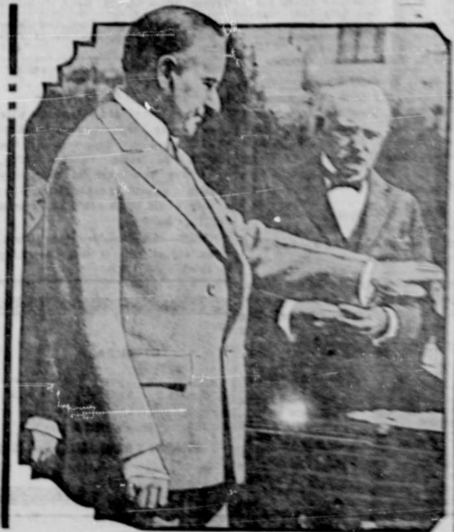
Photograph shows President Coolidge with his right hand and wrist encased in a bandage. The Chief Executive is able to use his hand for signing papers.