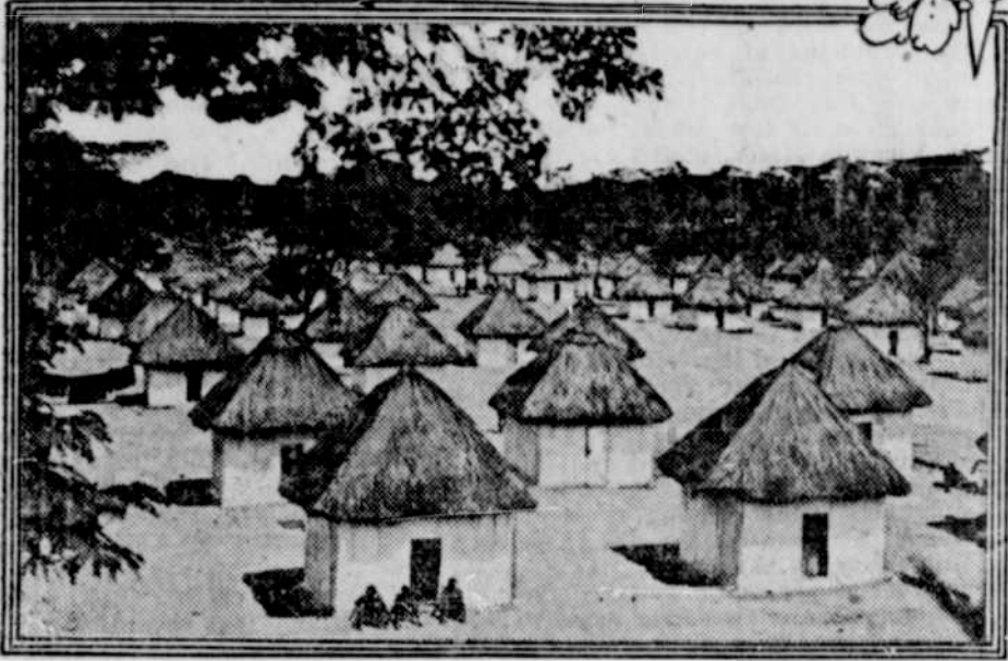
Workmen's Huts in the Belgian Congo

(Prepared by the National Geographic Society, Washington, D. C.)