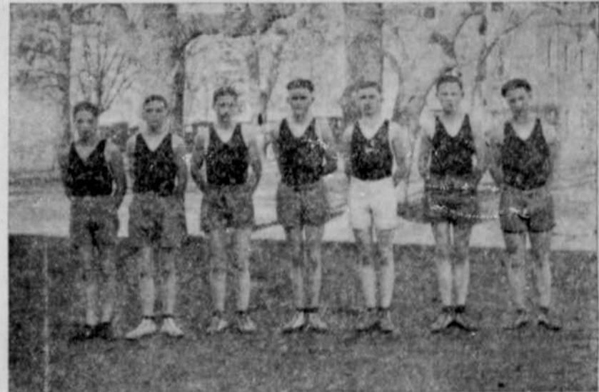
SECOND STRING MEN—BASKETBALL TEAM

This track team won for C. P. H. S. the annual Jackson county track and field meet silver award in 1925, making Central Point schools the county champs for the fifth successive year. They won the meet of the Jackson county fairgrounds April 25, by a score of 171.5 points, which gave them a margin of 29.5 points over their closest rival Phoenix, who ran up a total of 146 tallies.