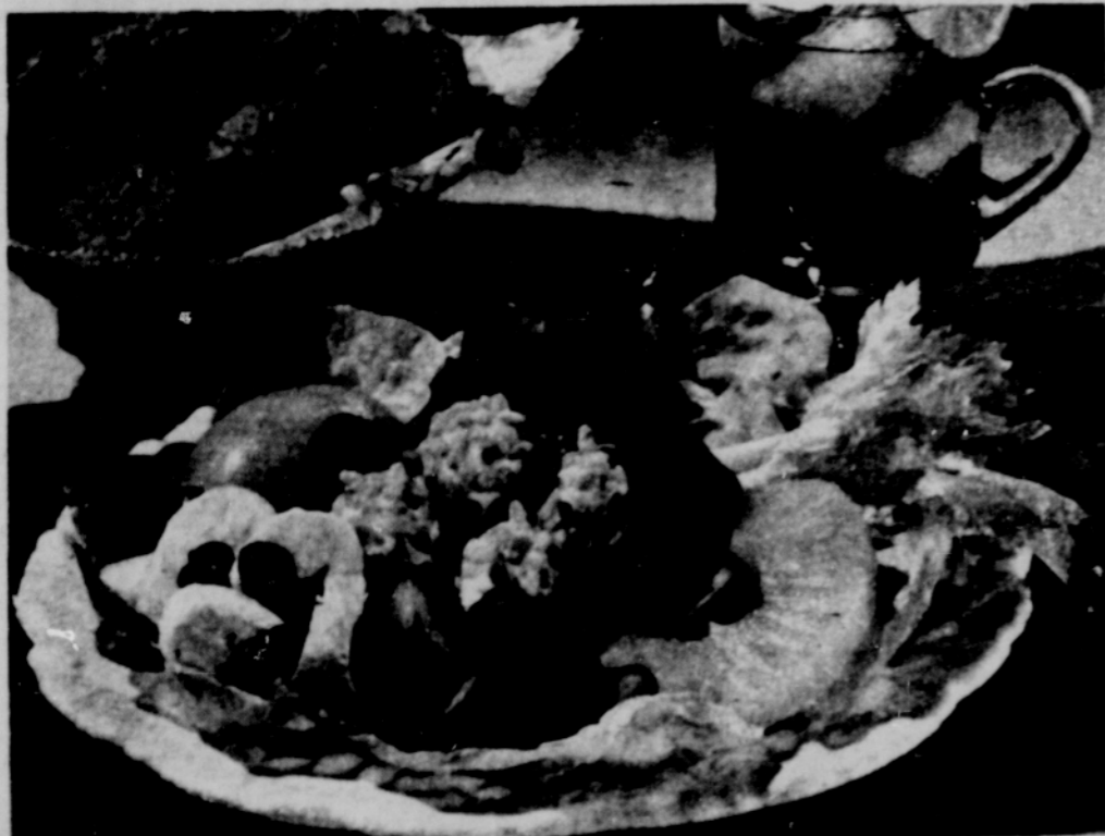
Put Cereal Cheese Ball in Center of Fresh Fruit-Salad Plate

The August edition will be devoted to the CWNA National Centennial Convention and will have a four-color picture of Ottawa at night for its cover.