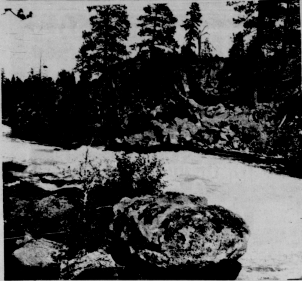
DILLON FALLS IN THE DESCHUTES RIVER is one of three waterfalls in the Lava Butte area. These were formed when the Deschutes cut a new channel through the lava flow and are one of the attractions drawing increasing number of visitors. Last year nearly 10,000 persons visited the public observation site on top of the volcanic cone.