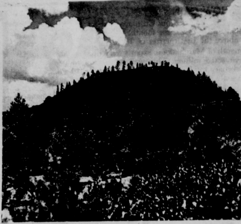
CENTRAL OREGON'S lava county derives its name from Lava Butte, shown above. The area has been given special classification in recognition of its geological and recreational qualities. The 5,016-foot butte was formed by eruption in a fissure. Most recent eruption is believed to have been 1,500 to 2,000 years ago.