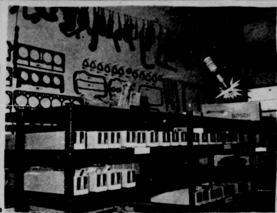
HOMERS RICHFIELD IMPORTED CAR PARTS 250 North Pacific Highway - Central Point 664-3266

Amazing Compound Dissolves Common Warts Away Without Cutting or Burning Doctors warn picking or scratching at warts may cause bleeding, spreading. Now amazing Compound W ® penetrates into warts, destroys their cells, actually melts warts away without cutting or burning. Painless, colorless Compound W, used as directed, removes common warts safely, effectively leaves no ugly scars.