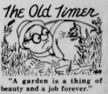
"A garden is a thing of beauty and a job forever."

Studies made in Europe and the United States at widely different periods of time all show that virtually no children below the age of 15 commit suicide, according to the Encyclopaedia Britannica.