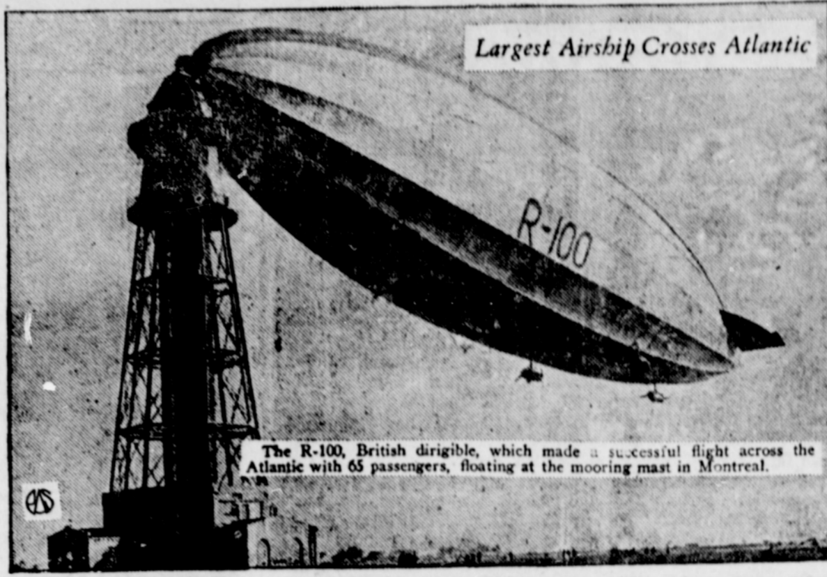
Largest Airship Crosses Atlantic