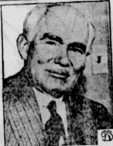
Dr. Lee De Forest, inventor of the radio "tube," whose patent on sound-film recording has been upheld by the courts.