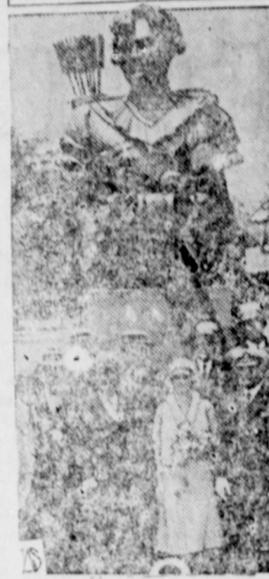
The old wooden ship's figure-head, a likeness of Tecumseh, the Indian Chief, which stood for years on the grounds of the U. S. Naval Academy at Annapolis, has been replaced by a bronze duplicate.