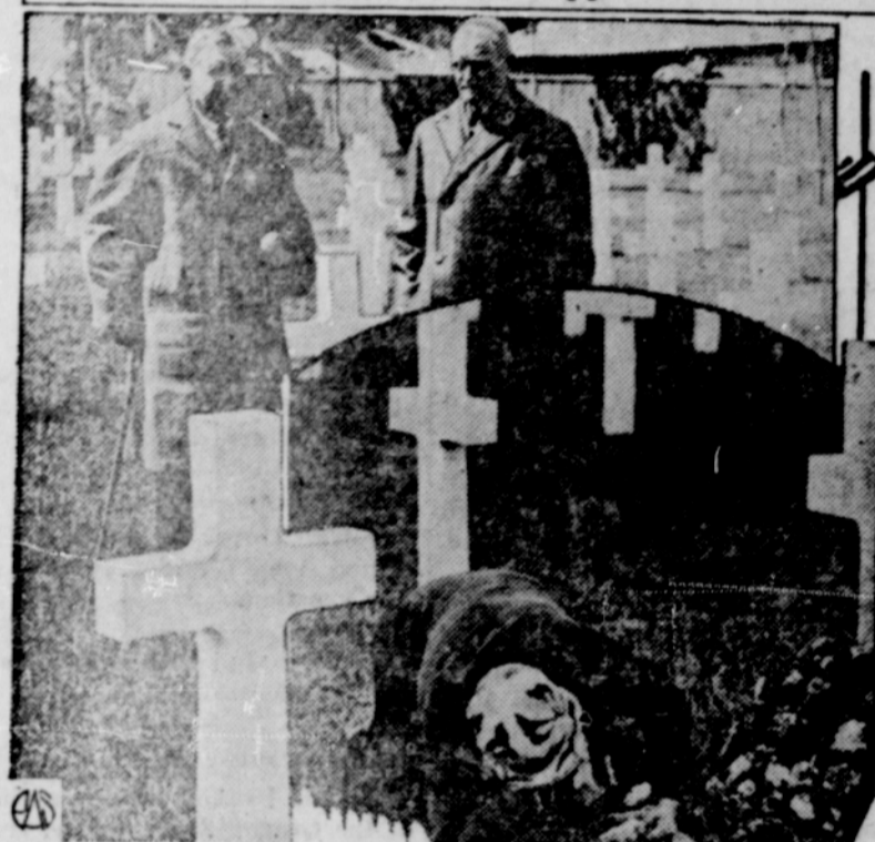
General Pershing and Ambassador Edge inspecting an American cemetery in Belleau Wood. Insert; a Gold Star Mother at her son's grave.