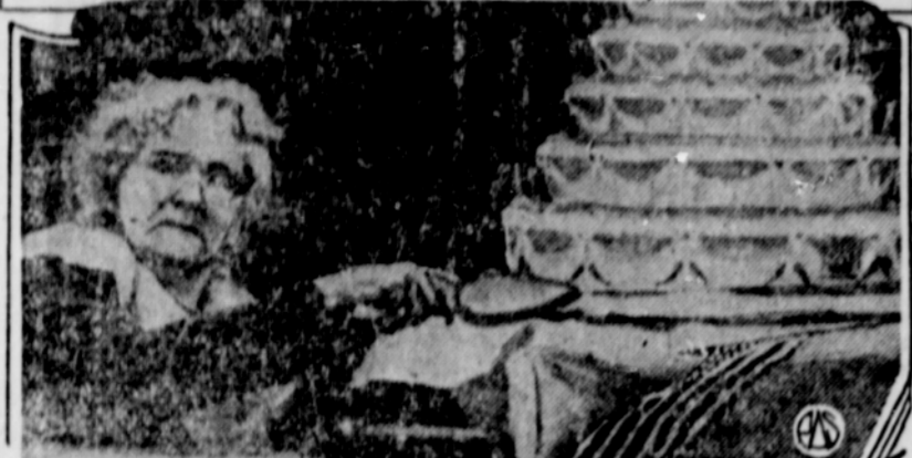
"Mother" Jones, former firebrand labor leader, celebrated her 100th birthday at her home near Washington, with many distinguished persons as her guests.