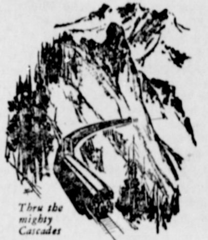
Through the mighty Cascades

Now Southern Pacific is completing a short line transcontinental railway through Southern Oregon and Northern California. The Cascade line of the SHASTA ROUTE