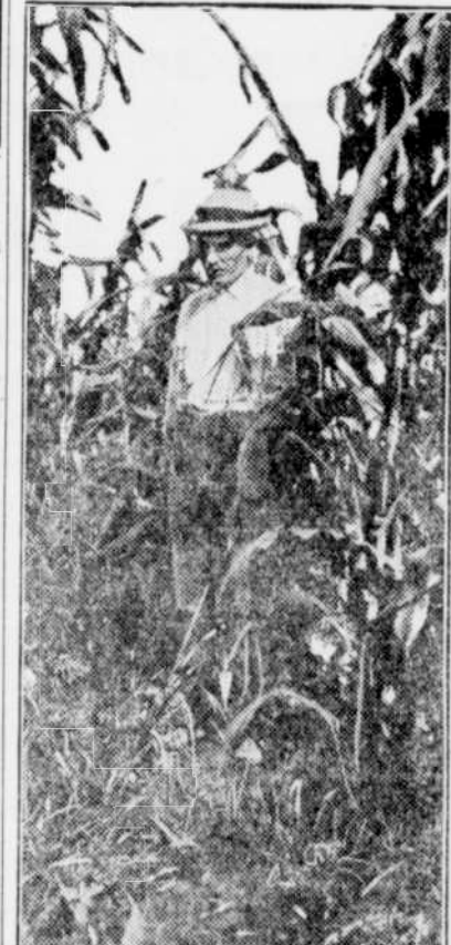
Corn From Tested Seed.

Mr. Hackleman says that about ten hours of actual labor would be required to test the seed for the 26 acres. By such testing the yield can be increased at least $1.50 worth. Hence the time required to test the seed is worth about $40, or about $4 an hour. The more corn a farmer grows the more money he can make by the test. The man who raises 100 acres can increase