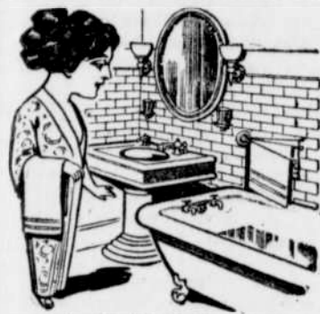
The Model Bath Room

FOR SALE—Full Blood Plymouth Rock Eggs; 75 cents for 15. Also six full-blood Plymouth Rock roosters (spring chickens) 75 cents to $1.00 each. George Obenchain, Central Point. 717