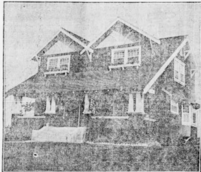
PERSPECTIVE VIEW—FROM A PHOTOGRAPH.

Design 840, by Glenn L. Saxton, Architect.