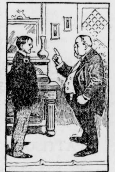
THE OLD MAN PERKINS FORBIDS HIS SON TO MARRY POLLY.

"I take it from my mother, who was a poet. My father also wrote several