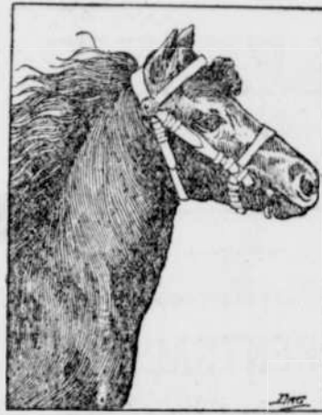
EVERYBODY'S FAVORITE. [A study in Shetland character.]

The class for stallions not to exceed 14.2 was probably one of the best ever shown. The ponies were distinctly high class, and several of them had been London champions. First prize was awarded to the stallion Little