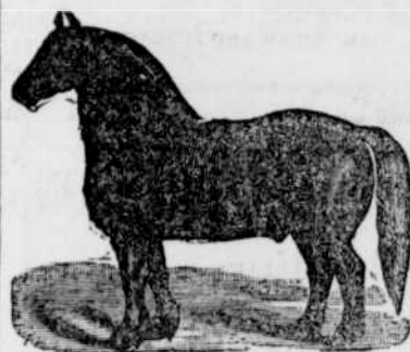
The Fine Porcheron Stallion "MORNING STAR"

CENTRAL POINT FURNITURE STORE, T. M. JONES, Propr.